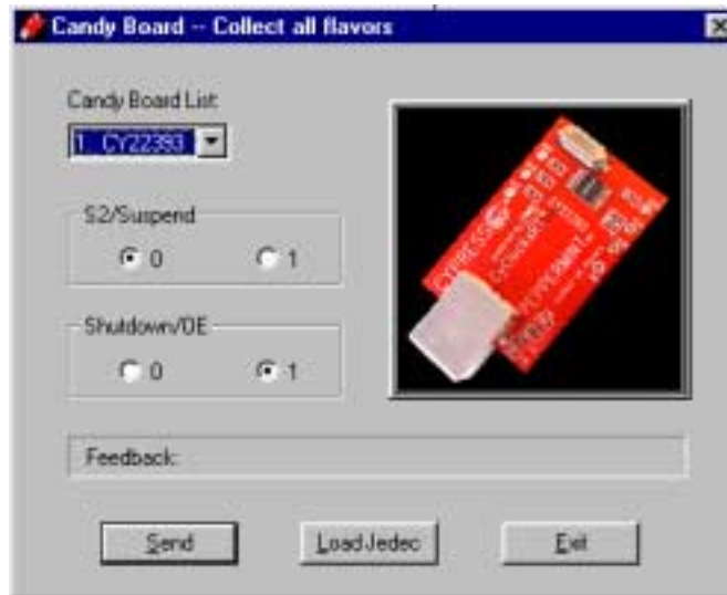
Figure 1. Candy Board Set-up Window

Windows is a trademark of Microsoft Corporation. CYClocksRT™ is a trademark of Cypress Semiconductor Corporation. All product and company names mentioned in this document are the trademarks of their respective holders.