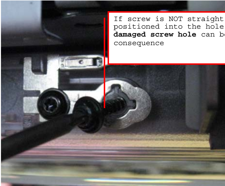
Fig 2 Screw not perpendicular to screw hole fastened.