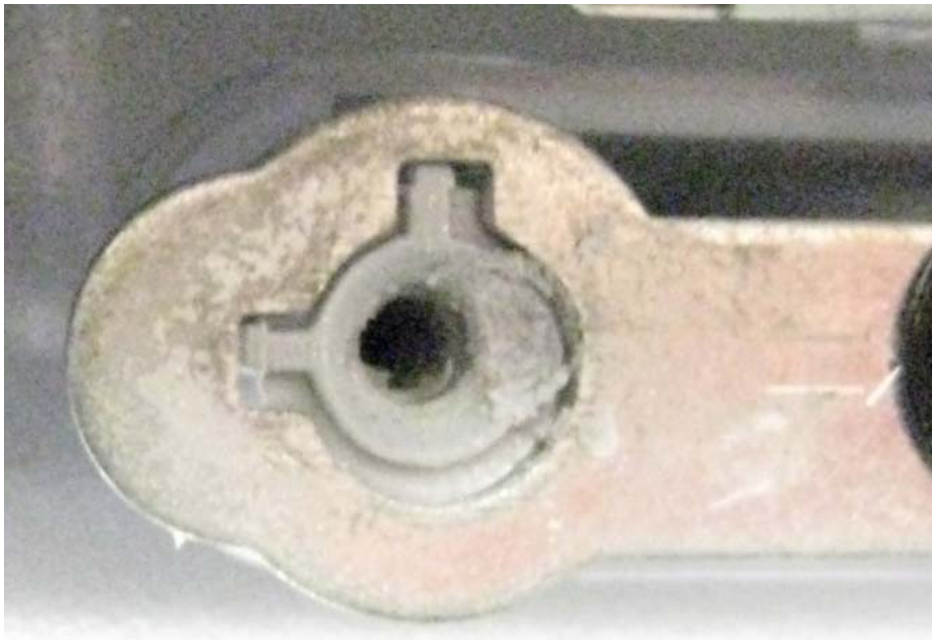
Fig. 3 Damaged screw hole.