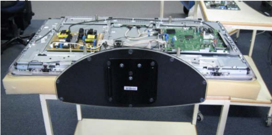
Fig. 5 TV placement.

b) Put the TV set onto a horizontal surface protected with foam to prevent the display from damaging: