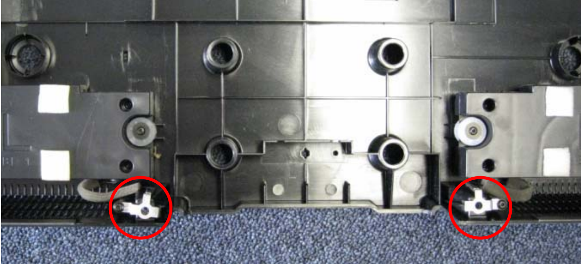
Fig. 4 Check contact lip positioning.

a) Control both positions at the backcover if metal lips are positioned well.