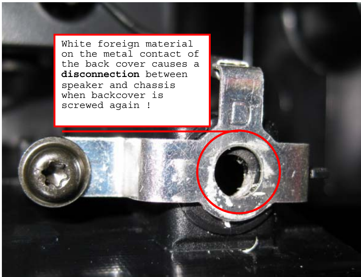
Fig. 1 Foreign material on the metal contact.

This can result in the TV not starting up, error protection, and broken audio amplifiers!